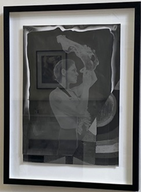
Left: The Oldest Fable I, 2022. Silver Gelatin Unique Prints. 50 x 40 cm.