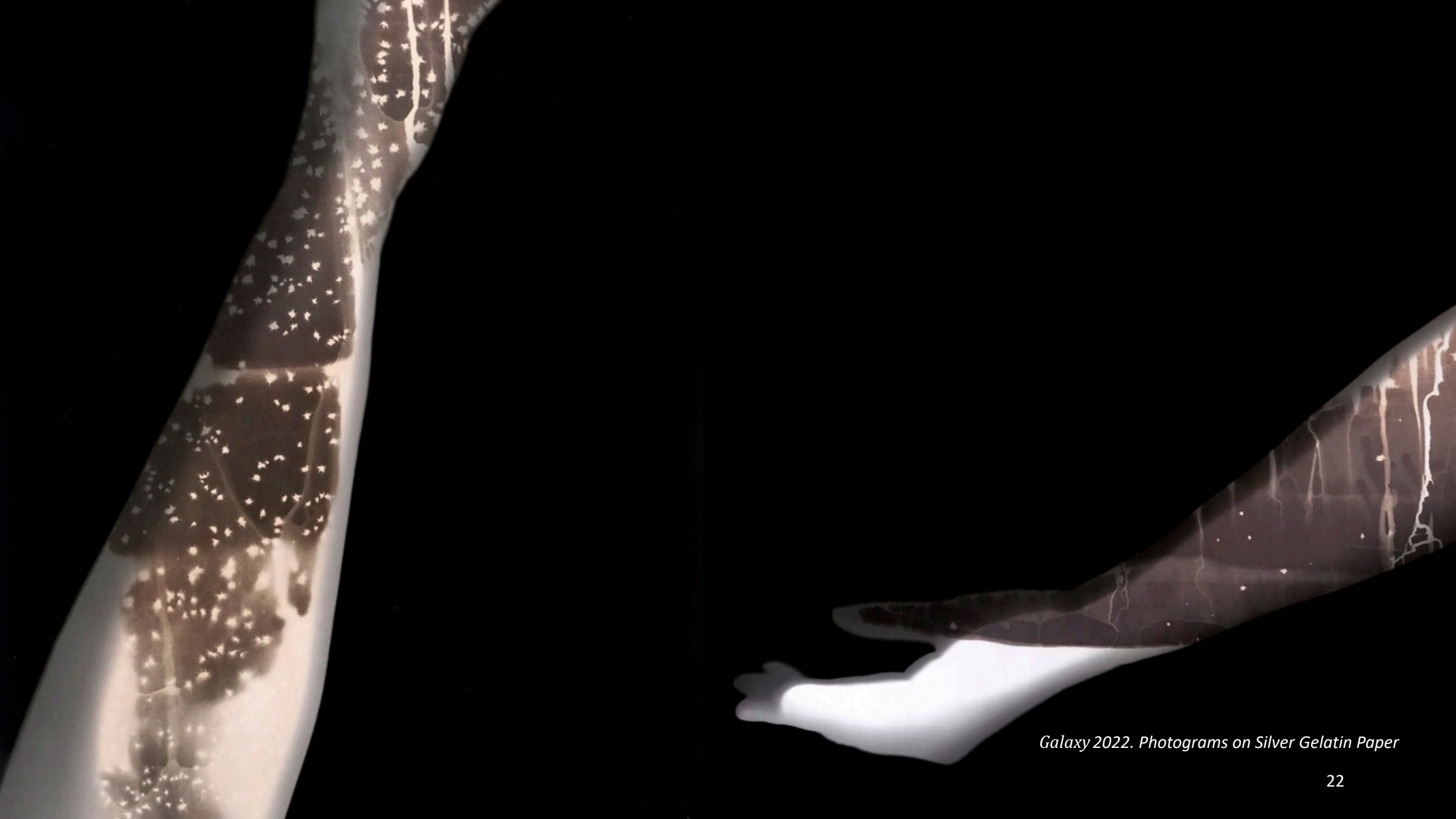
Galaxy 2022. Photograms on Silver Gelatin Paper