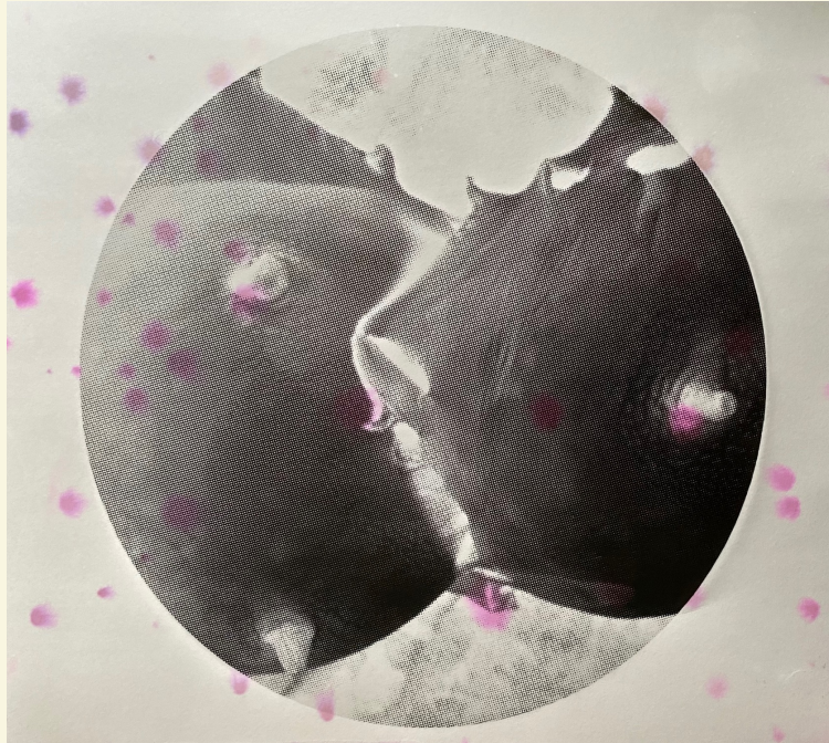
Mother Love 2023, hand-coloured contact print